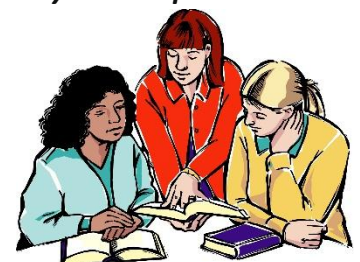
Women's Bible Study

The names of God are not just titles—they are promises. Add depth to your walk with Christ Jesus by learning the names that God uses to describe Himself in The Scriptures.