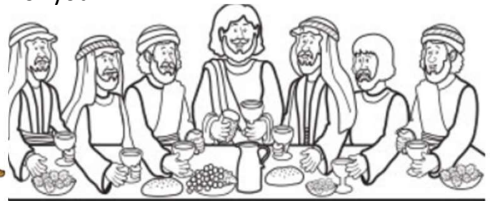
Jesus said to his disciples. "Do this in remembrance of me."

19 Then Jesus took some bread. He thanked God for it, broke it, and gave it to the apostles. Then Jesus said, "This bread is my body [b] that I am giving for you. Do this to remember me." 20 In the same way, after supper, Jesus took the cup and said, "This cup shows the new agreement that God makes with his people. This new agreement begins with my blood which is poured out for you."