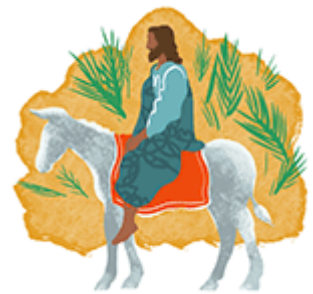
JESUS' TRIUMPHANT ENTRY INTO JERUSALEM