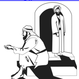
Lazarus & The Rich Man